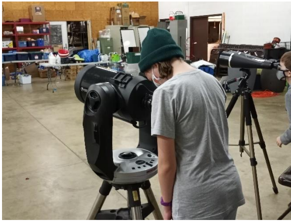
Hillsboro 4H member testing magnification power of telescope at Illinois Extension Office, Hillsboro, IL, 2/21/22.