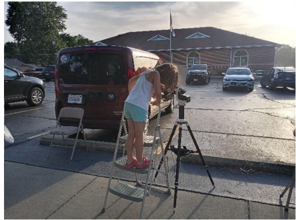
Participant views the Sun at Madison County ROE STEM Camp, Troy, IL, 6/15/22.