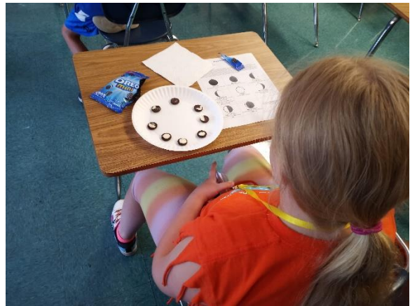
Participant makes Moon Phase Cookies at Madison County ROE STEM Camp, Troy, IL, 6/15/22.